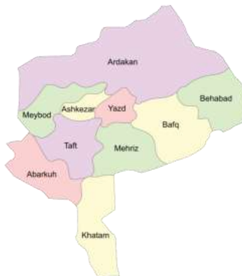
Figure 1. The geographical map of the cities of Yazd province in Iran

Area 10 includes: Qasem Naghi - Dehno - Seyed Mirza - Mohammadabad - Fahraj