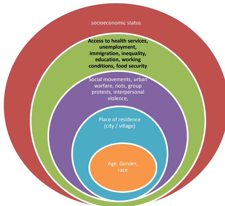
Figure 2, B. Division of social variables related to climate change based on impact levels