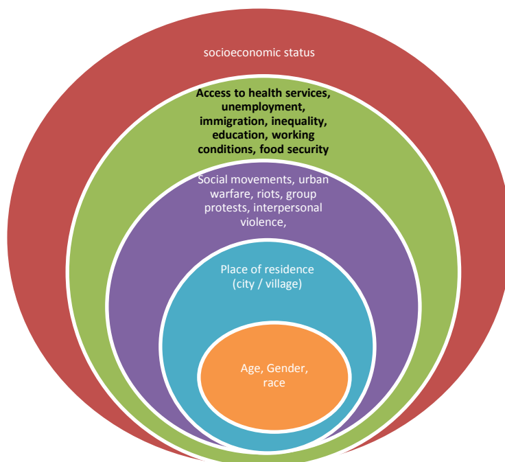
Figure 2, B. Division of social variables related to climate change based on impact levels