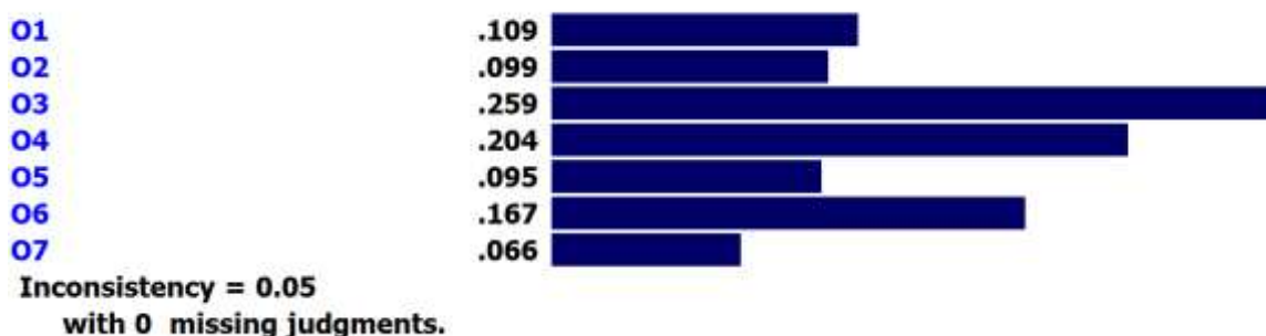
Figure 1. Prioritizing and weighting of reasons related to organizational factors

weight of 0.259, while the lowest weight or priority was due to the unwillingness to carry out changes with a weight of 0.066 (Figure 1).