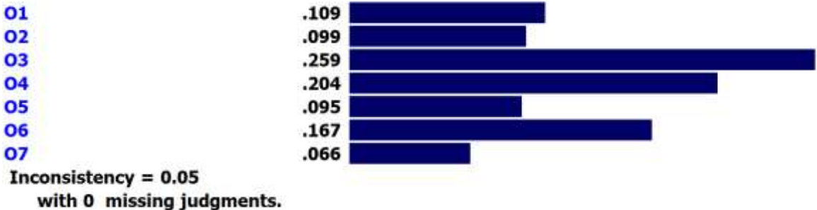
Figure 1. Prioritizing and weighting of reasons related to organizational factors

weight of 0.259, while the lowest weight or priority was due to the unwillingness to carry out changes with a weight of 0.066 (Figure 1).