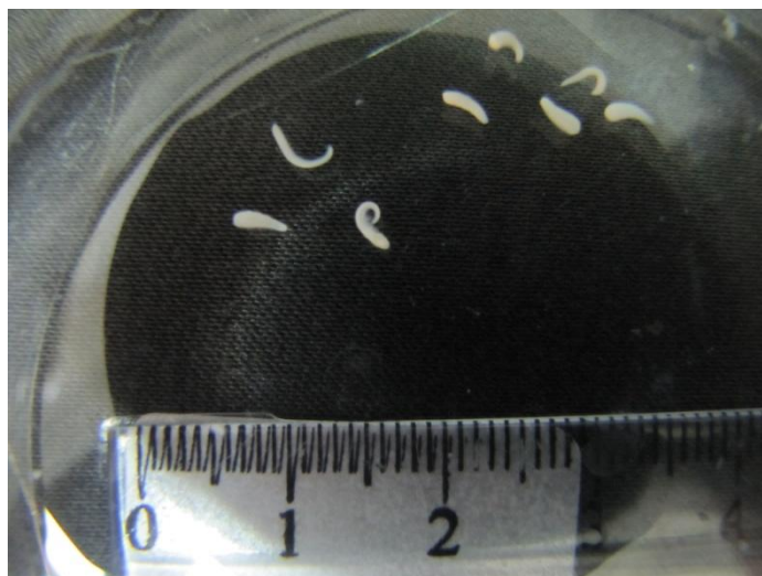
Fig. 1: Linguatula serrata nymphs isolated from a domestic ruminant slaughtered in Ehsan-Rey slaughterhouse, Tehran, Iran