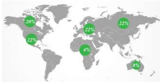
Figure 2. Dispersion map of the reviewed articles around the world