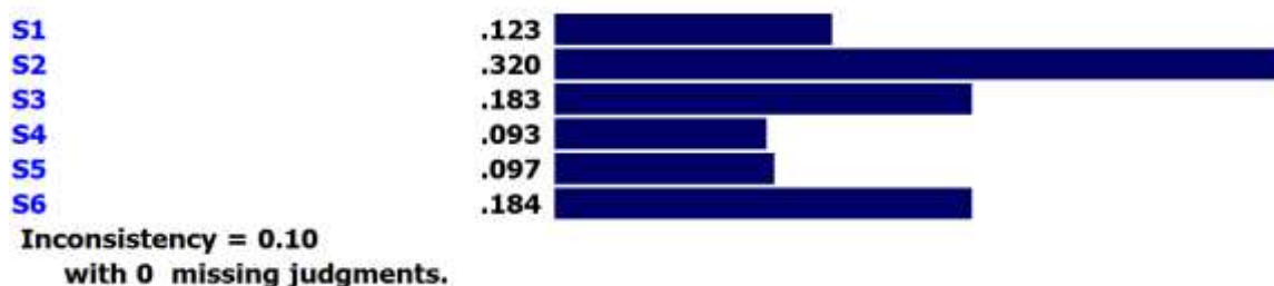
Figure 3. Prioritizing and weighting of reasons related to research skills

Regarding the factors related to the relationship between and access to the research findings, the highest weight and priority was observed in inaccessibility of actual articles (0.475) and the