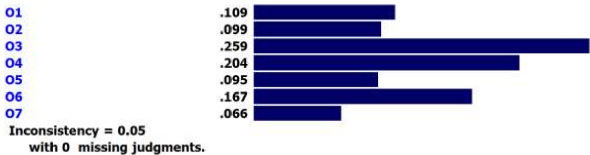
Figure 1. Prioritizing and weighting of reasons related to organizational factors

Based on the hierarchical analysis method and paired comparisons in organizational factors, the highest weight or priority was due to lack of independence to change care methods with a weight of 0.259, while the lowest weight or priority was due to the unwillingness to carry out changes with a weight of 0.066 (Figure 1).