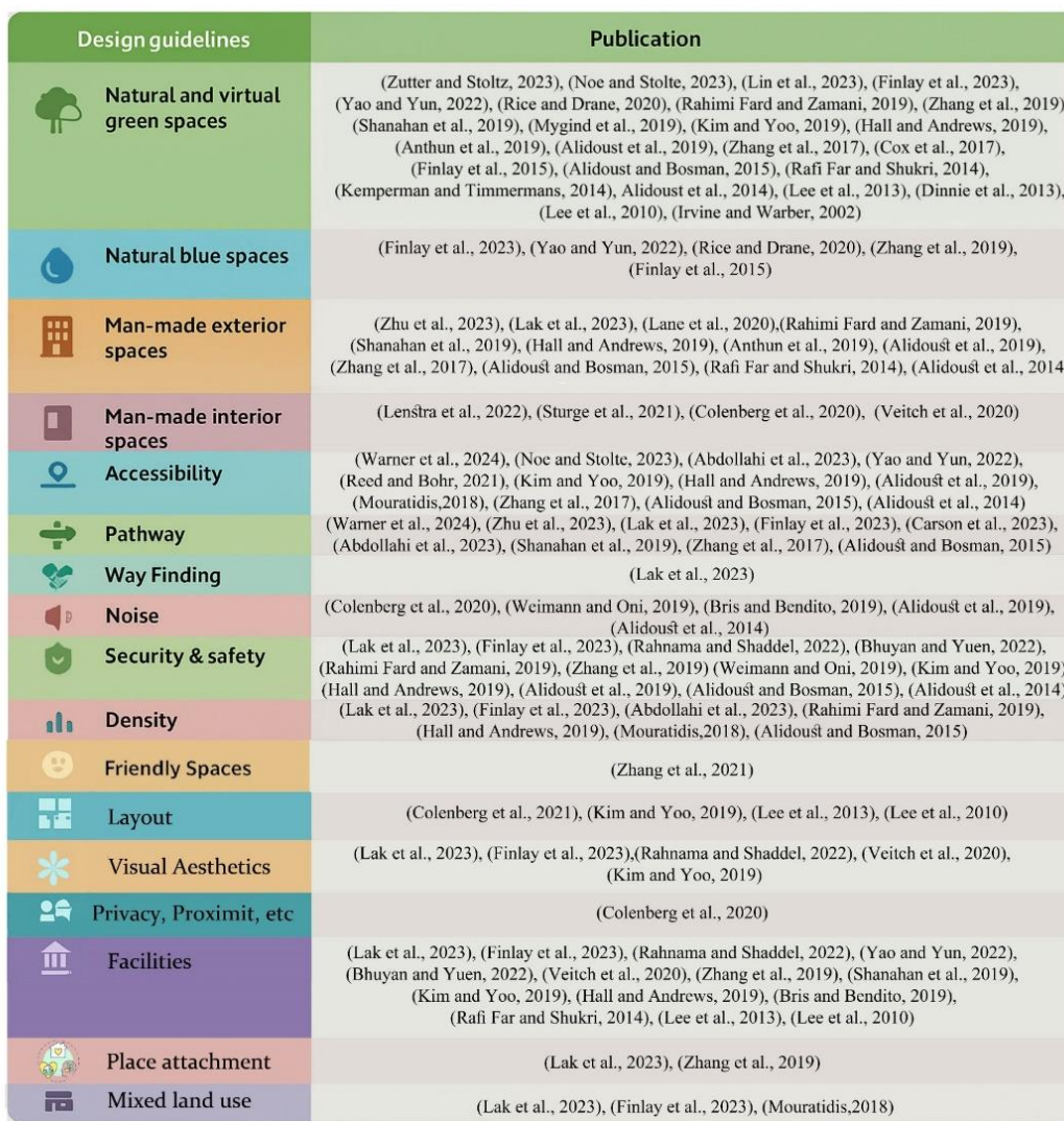
Table 2. Summary of design guidelines related to social health

openness, connectivity, and designated social areas—affects how individuals engage with one another. For example, the inclusion of shared lobbies and common rooms in apartment complexes has been favorably received for fostering social interaction. Well-planned layouts can promote a sense of community while supporting both private and public engagement (9, 22). In sum, these findings underscore the profound influence of environmental design on diverse dimensions of social health. Summary of design factors related to social health based on the names of authors who worked in this field and the number of publications referring to design factors are shown respectively in Table 2.